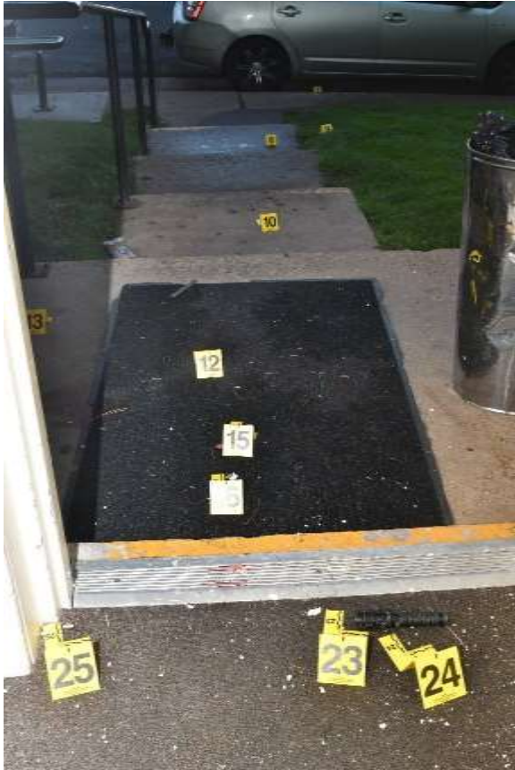
Shell casings and other evidence leading out of the door.