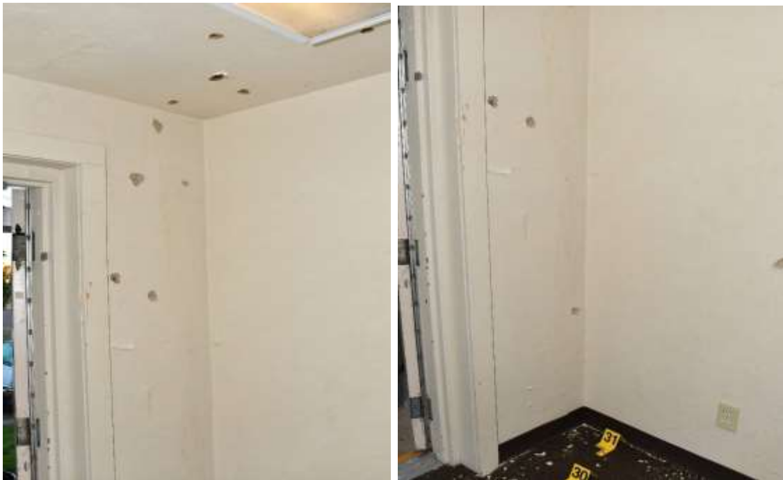
Bullet impacts around where Ofc. Snook and Corp. Farmer were positioned.